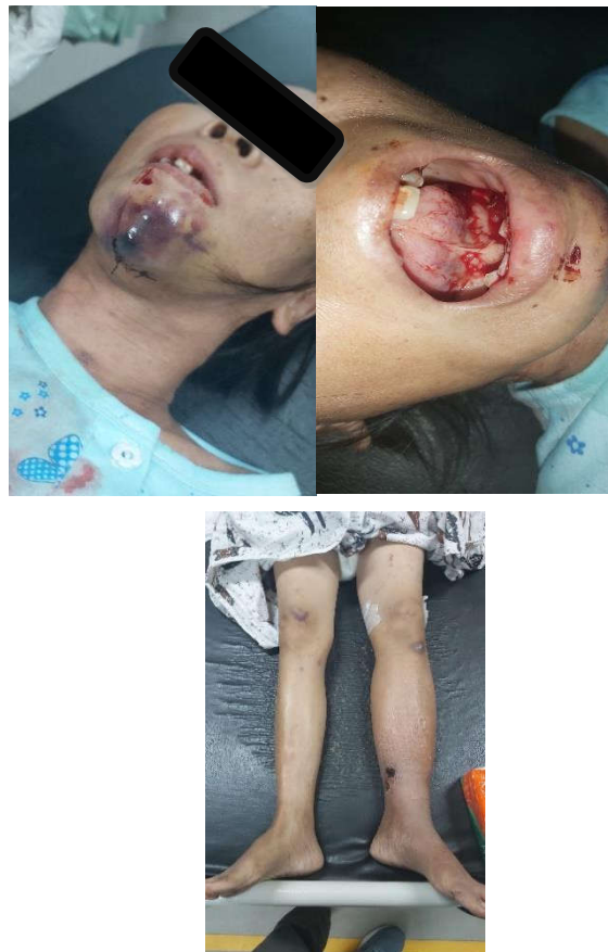
Figure 1. The patient's clinical photograph

A 43-year-old female admitted to hospital with complaints of bleeding in her mouth area since dawn. The patient's family admitted that a stone fell in the yard of the house a week ago, injuring the patient's chin. The wound on the chin was brought to the clinic and treated with 2 hectings. She was back to normal activity after wound healed and she could eat or drink as usual, but today at around 5.00 a.m., she admitted that his mouth was bleeding. Her family claimed that she developed sores on her nails two months before fasting, but that they healed after she visited the clinic's doctor.