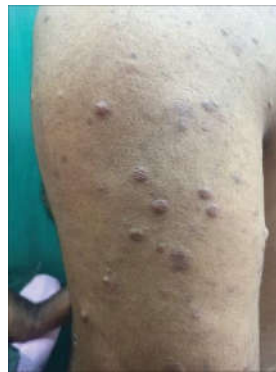
Figure 3. Classical ENL lesions, with crops of erythematous, tender nodules all over the body 23

According 39%–77% had multiple ENL episodes.15.1% of ENL cases have four or more episodes. Approximately a third of Ethiopian ENL patients suffer for more than two years.It lasted 18.5 months in India. Episodes can last anywhere from 14 days to 26 weeks, according to research. Study found five ENL recurrence risk variables. LL subtype, smear >4+, more than five nerves swollen, cutaneous nodules or infiltrate. According 30%–50% of ENL cases were moderate-to-severe.Moderate and severe ENL increased with a 12-month MDT. Most studies identified the highest prevalence of ENL in the first year of MDT, although some detected it in the second and third years. 27,28