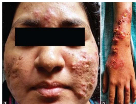
Figure 4. (a) Vasculonecrotic ENL lesions over the face. (b) Vasculonecrotic ENL lesions with ulceration seen over the forearm 23

Typically, a Type II lepra reaction occurs at the lepromatous extremity of the spectrum. It manifests in various ways, including the classic erythema nodosum leprosum, the erythema polymorphous-like reaction, and the Lucio phenomenon. Multiple harvests of evanescent, erythematous, tender nodules and plaques are characteristic of classic ENL. Lesions such as bullous, pustular, ulcerated, hemorrhagic, and erythema multiforme are uncommon varieties. Lesions are frequently observed on the extensor surface of the extremities or the face. As lesions fade, they may manifest on the forearms and quadriceps as robust induration. 23